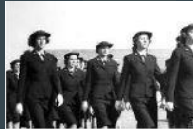
WAVES (Women Accepted for Voluntary Emergency Service)