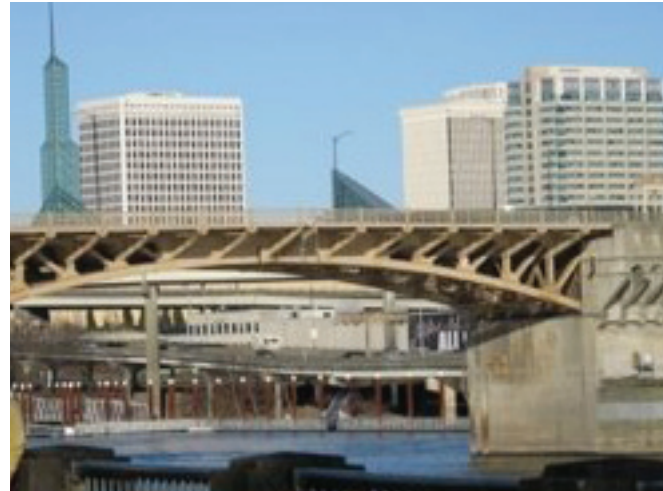
The Burnside Bridge and the convention center in the background

Marrakesh Moroccan Restaurant – 1201 NW 21st Ave, This is an experience best shared with friends, sit on the floor and eat with your fingers. Sweet Basil Thai- 3135 NE Broadway, just North East of the Convention center area is Broadway with cute shops and restaurants. This one is quite