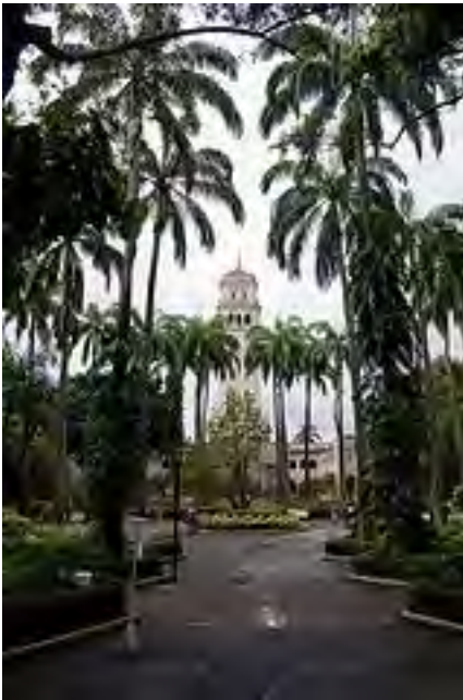
University of Puerto Rico