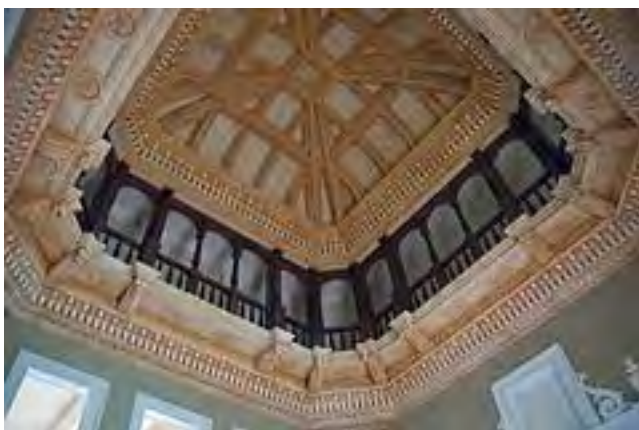
University of Puerto Rico

http://conference.ifla.org/sites/default/files/files/papers/ifla77/196-kealy-en.pdf