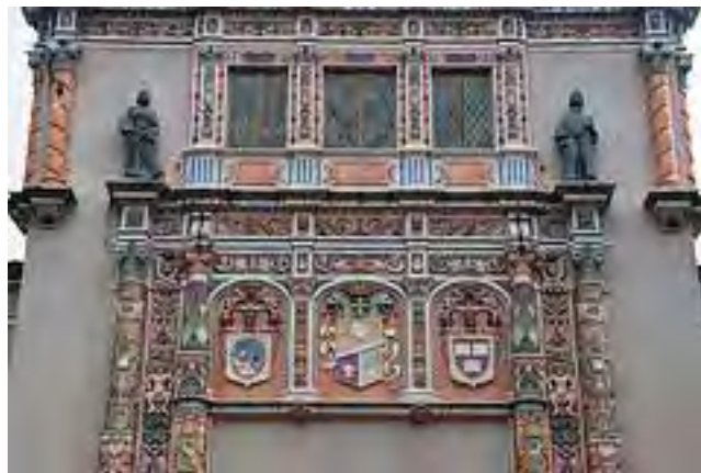
University of Puerto Rico