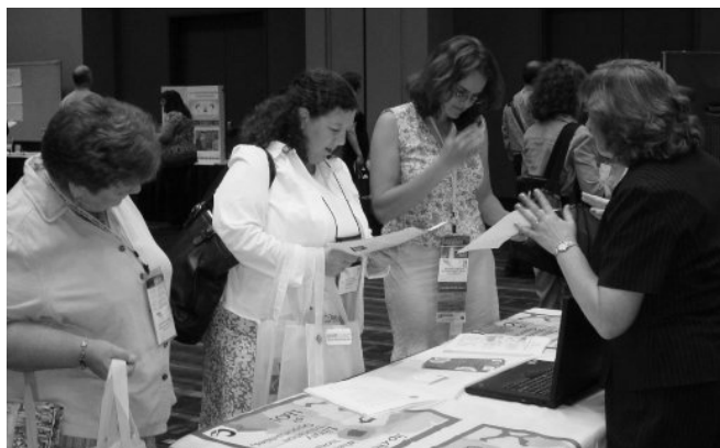
Attendees picking up information at the Training Showcase

From innovative training resources to staff development day ideas, the 6th annual Training Showcase had something for everyone! Two hundred eager attendees hiked over to McCormick Place South hoping to find speakers for their next event, and ideas for innovative training initiatives and best practices in staff training, staff development and continuing education. They were not disappointed! Attendees had a blast at this year's Training Showcase! Here are a few highlights in case you weren't able to attend: